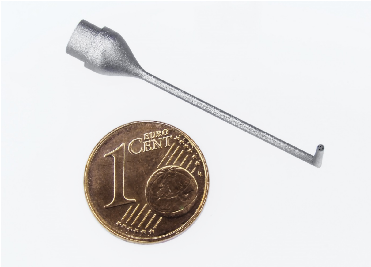
Abbildung 2 - Additively manufactured flow measurement probe from 3D MicroPrint

field of microfluidics, optimized flow properties and function integration and thus completely new possibilities for our customers. By using Micro Laser Sintering technology, excellent mechanical properties and a high level of detail accuracy are achieved on the filigree flow measurement probes. Due to the production from only one part, assembly times are eliminated and the product is robust and durable even in harsh operating conditions.